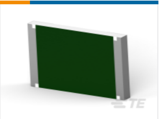
TE Part #5-2176408-3 3560 5M6 5%