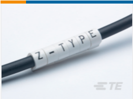
TE Part #EC0366-000 Z-Type Push-On Markers