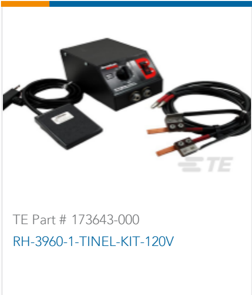
TE Part # 173643-000 RH-3960-1-TINEL-KIT-120V