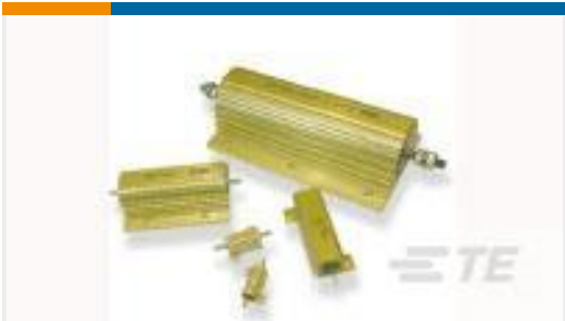
TE Part #8-1625971-2 HSA25 R22 5%