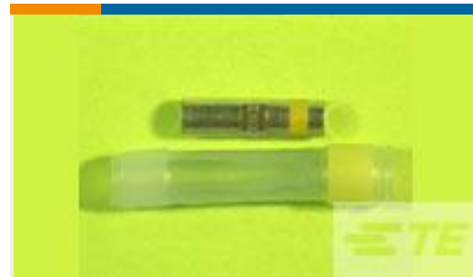
TE Part # 650110-000 D-436-0128