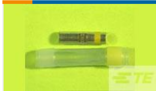
TE Part # 650128-000 D-436-84