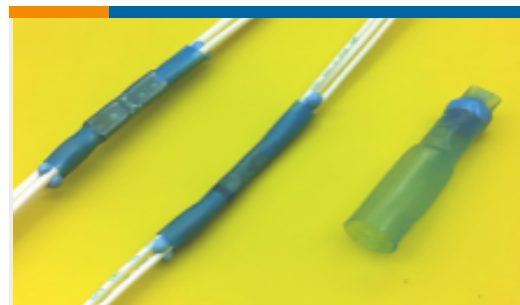
TE Part # 650134-000 D-436-90