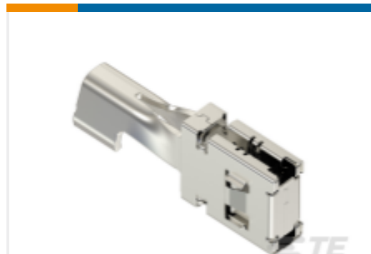
TE Part #1-2840573-2 PCON12,TERMINAL,FAM SLD/UNSLD