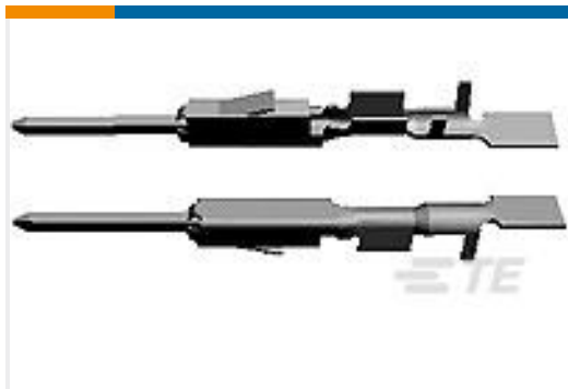
TE Part #5-963716-1 MQS0,63 Sn tab LL unseal. 0,5-0,75