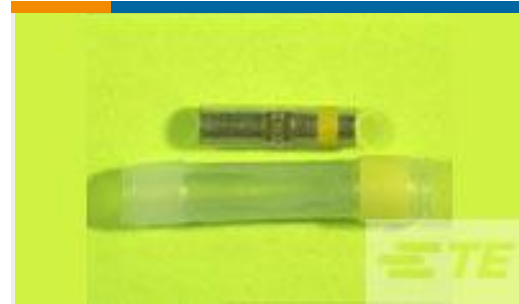
TE Part # 650098-000 D-436-75