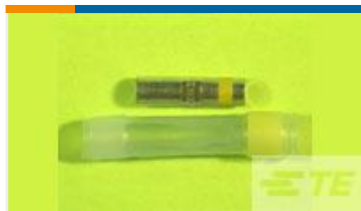
TE Part # 650099-000 D-436-76