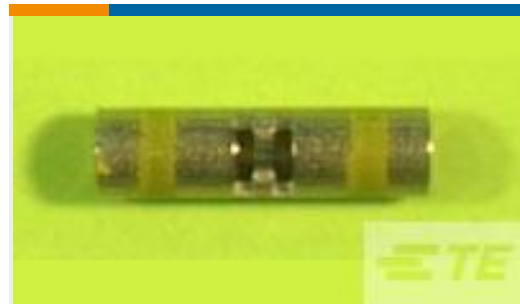
TE Part # 650150-000 D-436-0119