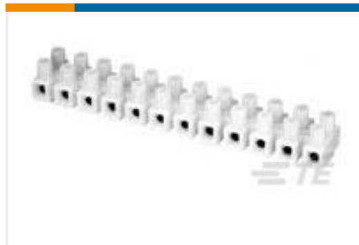
TE Part #1-1776296-0 TSB5001031DS=EUROPA T-BLK,10MM