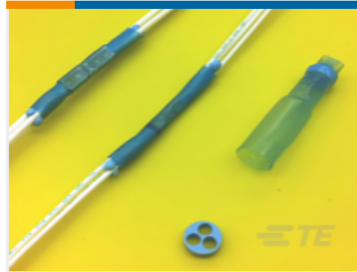
TE Part # 650129-000 D-436-85