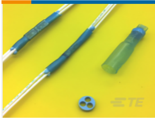
TE Part # 650072-000 D-436-42