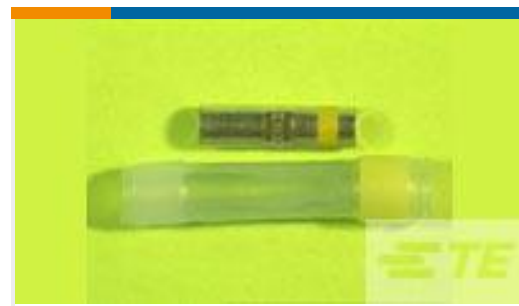
TE Part # 650076-000 D-436-38