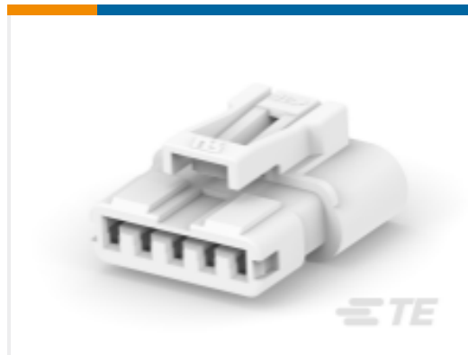
TE Part #2321918-5 PLUG HOUSING SDL2.5 WATERPROOF 5PIN