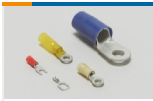
Rings & Spades(181)