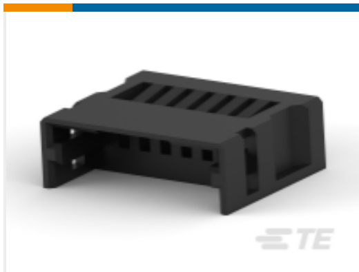
TE Part #2040974-1 PLUG HSG, MINI VP 1.0MM W TO B CONN.