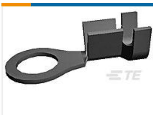
TE Part #1742456-2 RT .265 DIA TERMINAL 10-6 AWG TPCU