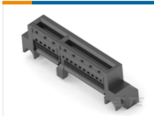
TE Part #2340326-1 ASSY STRADDLE MOUNT 84P 062 SLIVER 2.0