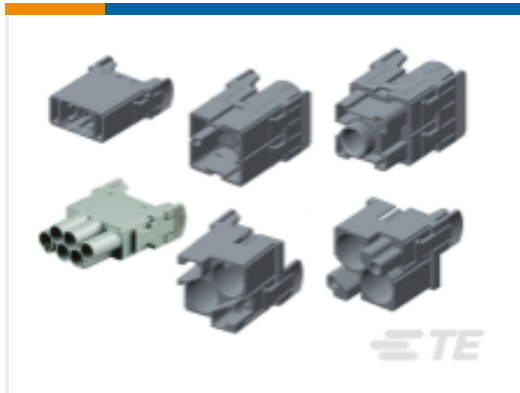
TE Part #T2111252101-007 HDC HMN - RAIL COMPLIANT MODULAR SYSTEM