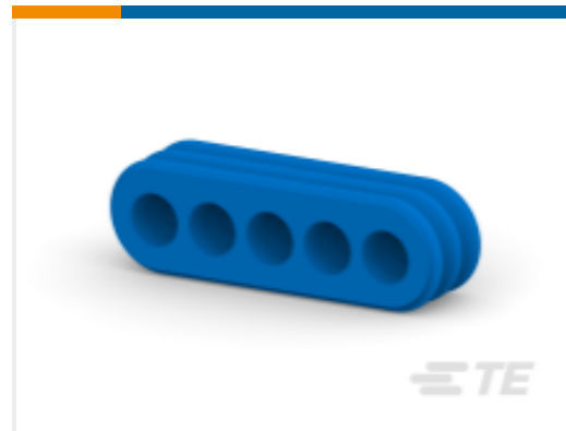
TE Part #2321922-5 REAR WIRE SEAL 5PIN