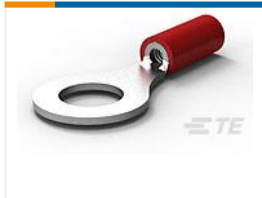
TE Part #2-342104-1 TAPE MOUNTED 22-16 F.E. TERMIN