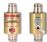
Lightning Arrestor LABH350NN (Sold Separately)