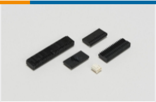
Wire-to-Board Connector Assemblies & Housings(65)