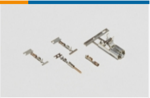
Wire-to-Board Connector Contacts(26)