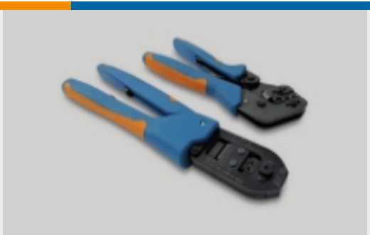
Portable Crimp Tools(33)