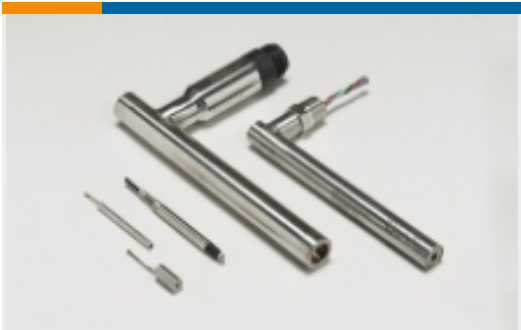
Linear Position Sensors - LVDT/LVIT(1)