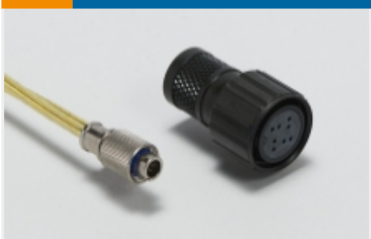
Standard Circular Connectors(528)