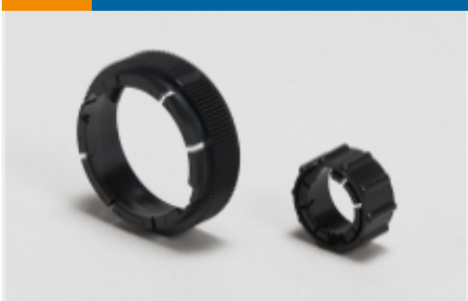
Circular Connector Adapters(2)