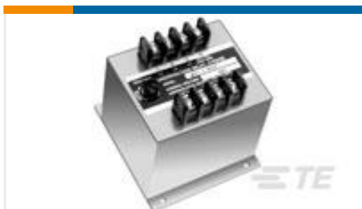
TE Part #1618108-4 WOV-1-240=WILMAR OVERVOLTAGE 2