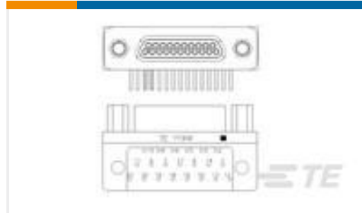
TE Part #1532252-2 M83513/10-C01CP = MCKS-C2-P-21PRT1