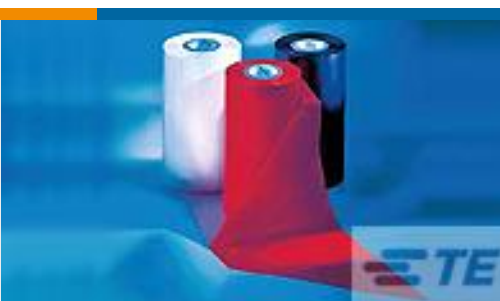
TE Part #742412-000 1330-0607-10