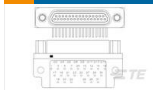
TE Part #1532262-6 M83513/13-E02CP = MCKS-C2-P-31SRT1A