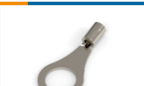
TE Part #1958424-1 SOLIS R HR 26-22, #8 STUD