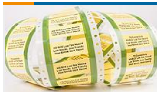
TE Part #C04635-000 HX-SCE-1K-4.8-50-S1-9