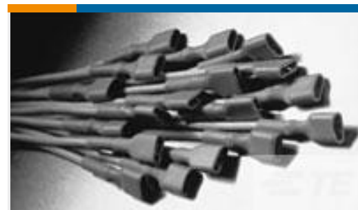
TE Part #1318974002 LSTT-6.4-9-SP