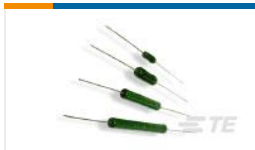
TE Part #3-1623774-9 C14 6K8 5% (LOOSE)