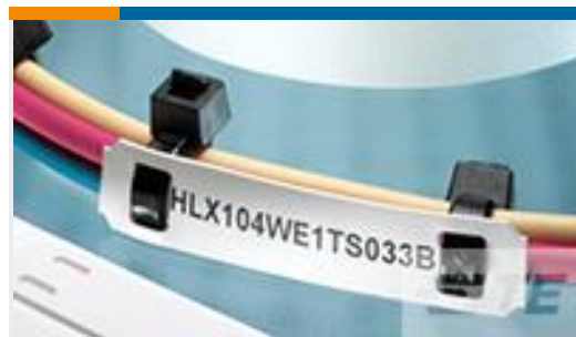
TE Part #EC7633-000 HLX104WE1TS070B