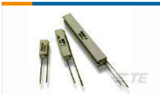
TE Part #3-1623732-5 BCHE 7 W 3K9 5%