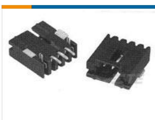
TE Part #5-147323-8 09 MTE HDR SRRA SMT.100CL