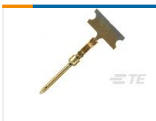
TE Part #66507-2 PIN CONTACT,20DF