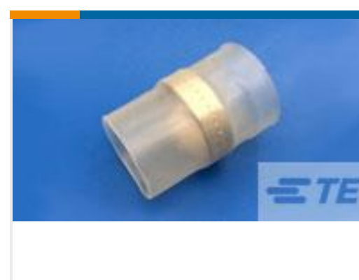
TE Part #696437-000 B-051-00-01