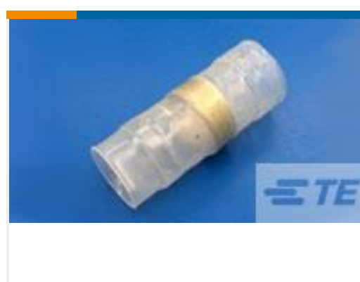
TE Part #696453-000 B-053-70