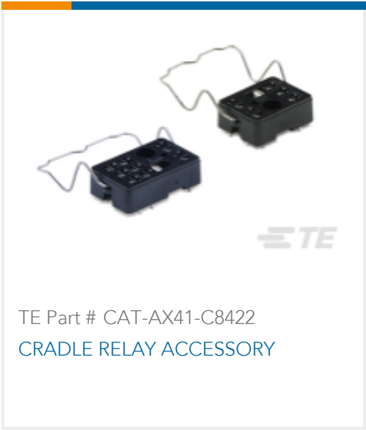
TE Part # CAT-AX41-C8422 CRADLE RELAY ACCESSORY