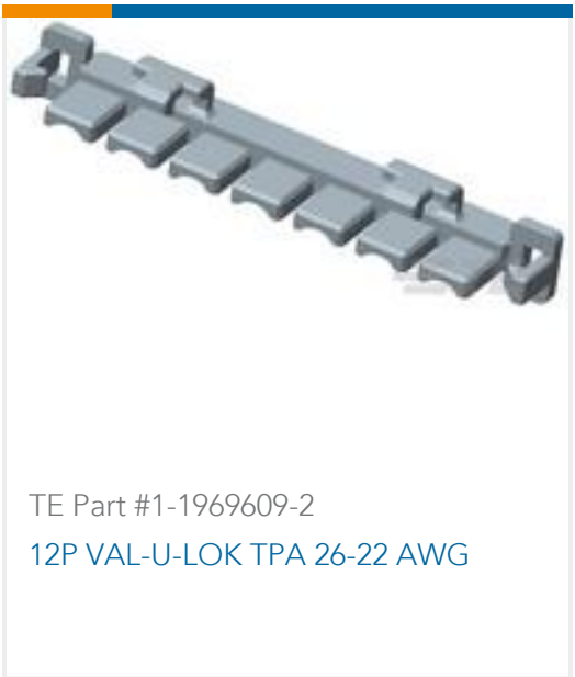
TE Part #1-1969609-2 12P VAL-U-LOK TPA 26-22 AWG