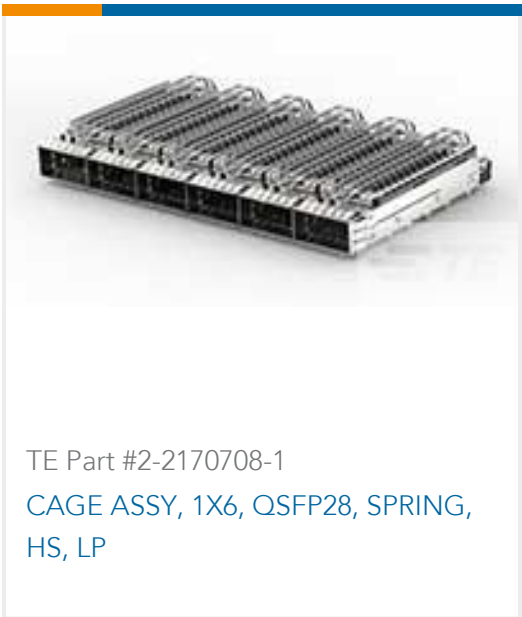
TE Part #2-2170708-1 CAGE ASSY, 1X6, QSFP28, SPRING, HS, LP