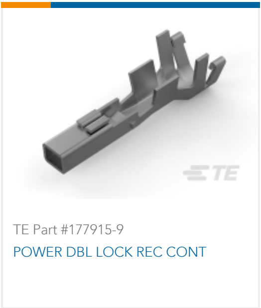
TE Part #177915-9 POWER DBL LOCK REC CONT