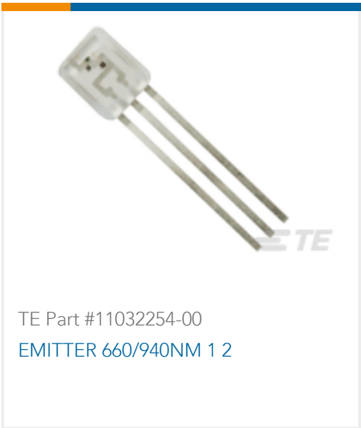
TE Part #11032254-00 EMITTER 660/940NM 1 2