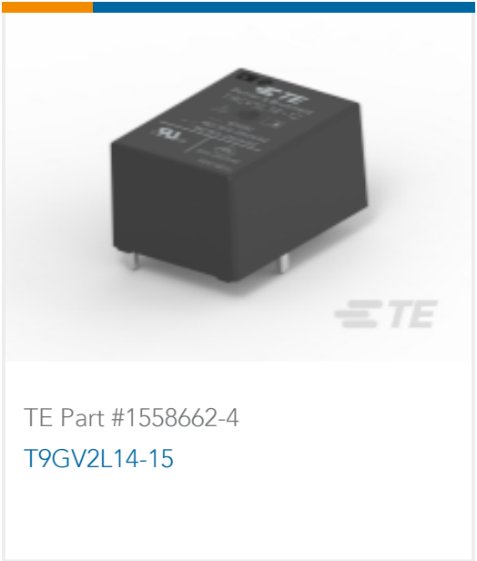
TE Part #1558662-4 T9GV2L14-15