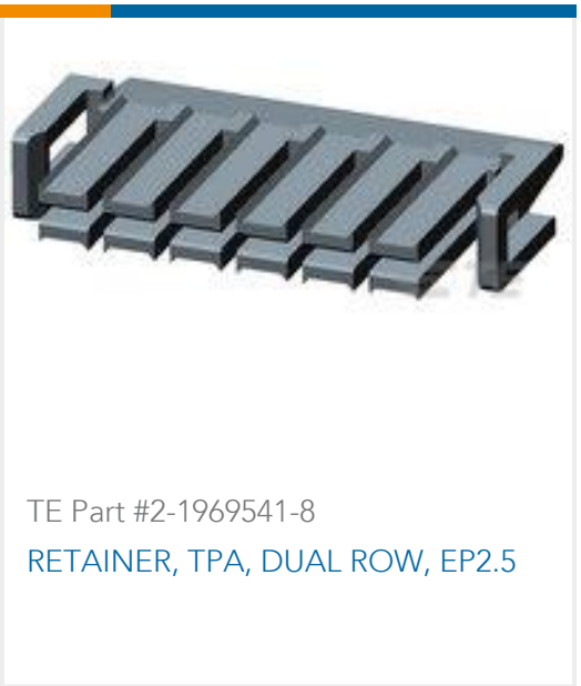
TE Part #2-1969541-8 RETAINER, TPA, DUAL ROW, EP2.5