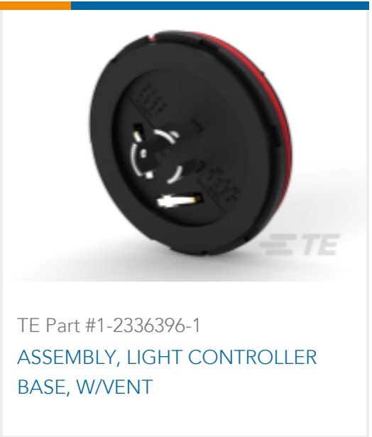
TE Part #1-2336396-1 ASSEMBLY, LIGHT CONTROLLER BASE, W/VENT