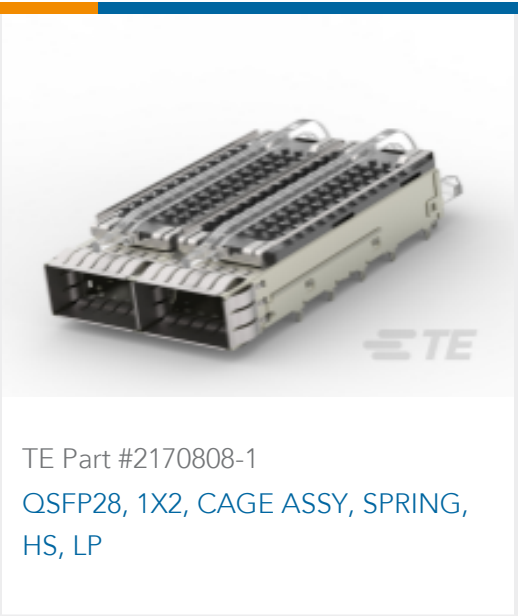
TE Part #2170808-1 QSFP28, 1X2, CAGE ASSY, SPRING, HS, LP