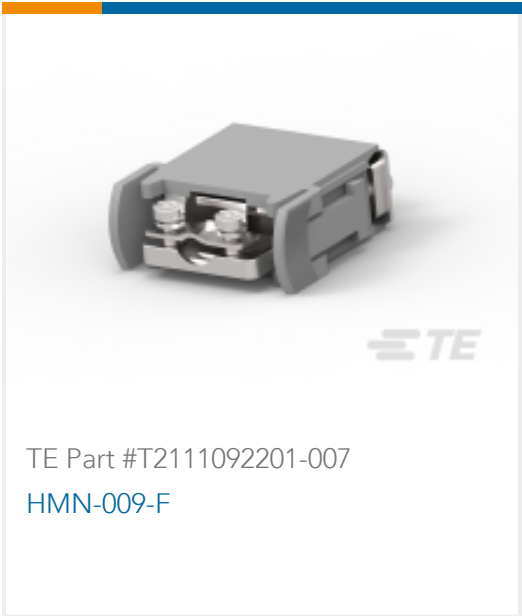
TE Part #T2111092201-007 HMN-009-F