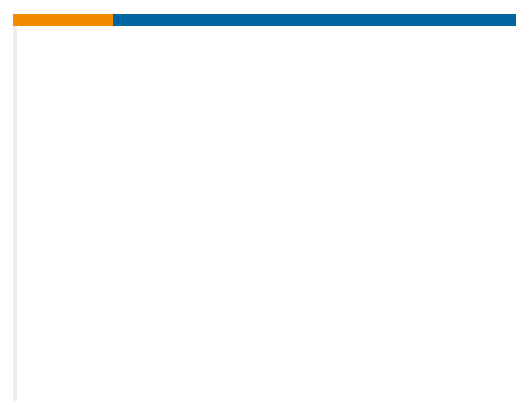
TE Part #131232-1 TNC E TYPE PLUG ASSY