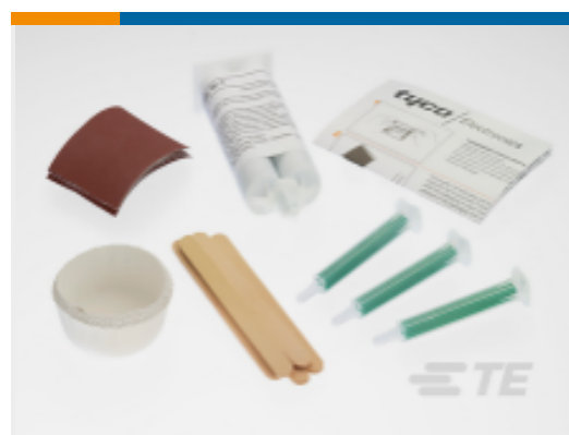
TE Part # 657863-000 S1125-KIT-8