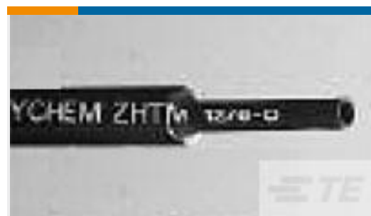
TE Part #2155384003 ZHTM-12/6-0-SP