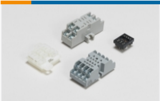
Relay Accessories, Sockets & Clips(7)