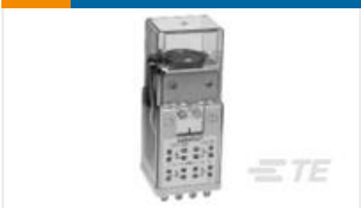
TE Part #1423156-1 GPI=RLY,120VAC