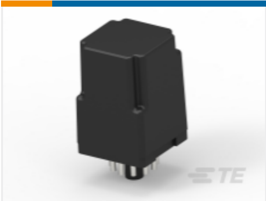
TE Part #1393100-9 KAP-5DG-24=KA/KB/KC/KR