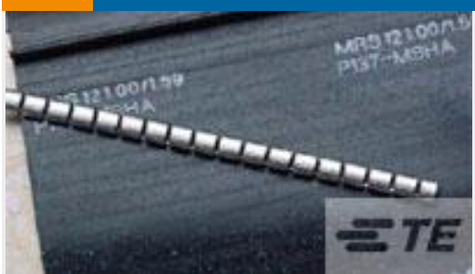
TE Part #570500-000 MRS-12-10