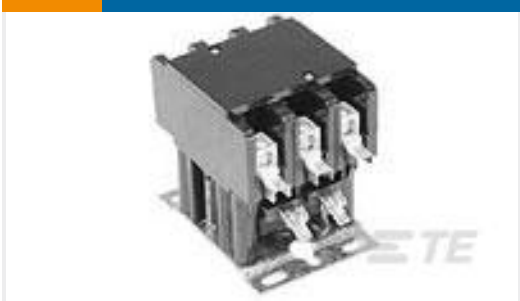
TE Part #1611020-2 3100Y30K16999CJ=50A 3P 208/240