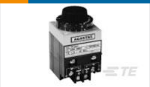
TE Part #1423160-5 7014AE=RLY,STD,ON,4P,120-VAC,