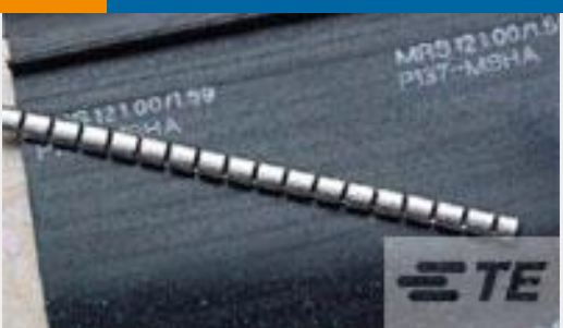
TE Part #326257-000 MRS-12-24