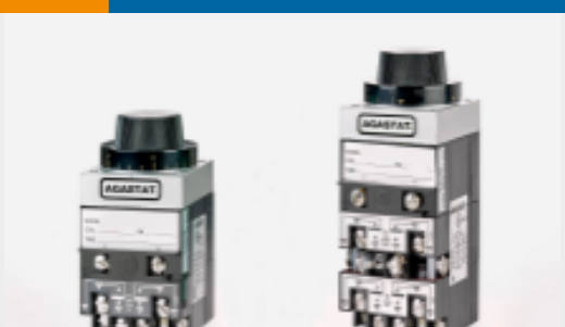
TE Part #3-1423166-6 7024OC=RLY,STD,OFF,4P,24V,15S