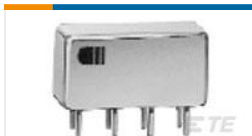
TE Part #2-1617031-1 HFW1201K45M = M39016/6-109M