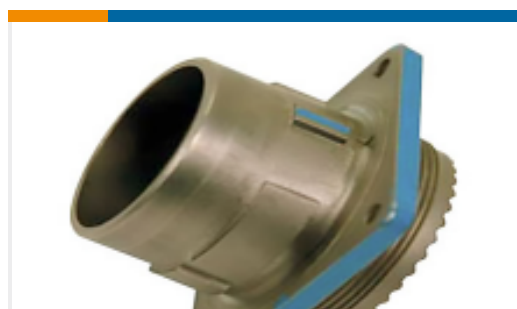
TE Part #YDIV40E21-35SNC009 RECP ASSY