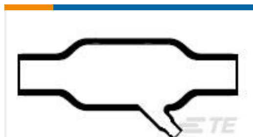
TE Part #153282-000 342A012-25/225-0