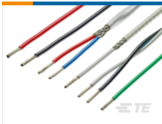
TE Part #8028773001 100G1121-0.50-0/9-0