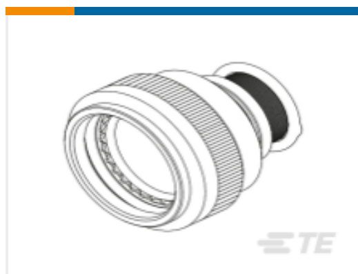
TE Part #131975-000 TXR40SJ00-1006AI