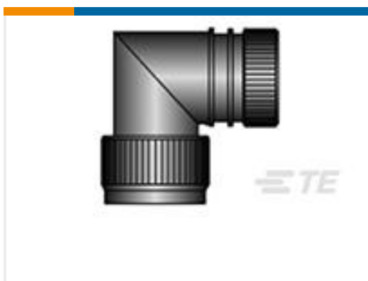
TE Part #CA8086-000 HEX40-AB-90-09-A1-2