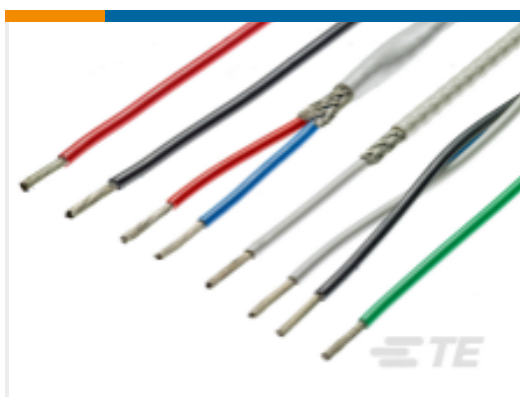
TE Part #185427-000 44B1131-16-MST3-9CS2275