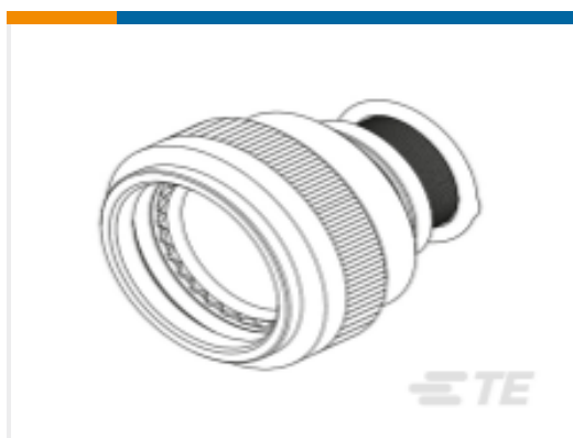
TE Part #935961-000 TXR40BW00-1204AI