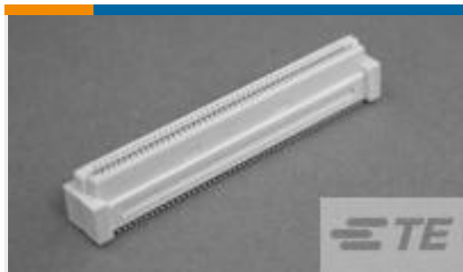
TE Part #5-5179232-5 0.8FH,R09H.5,120,08/Sn,TU,SC