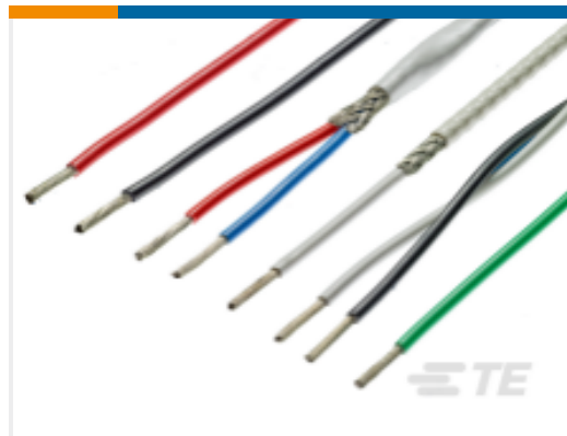
TE Part #8934233001 100G1121-1.00-2/6-0