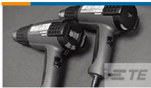
TE Part # CJ2087-000 HL2010E-KIT-120V