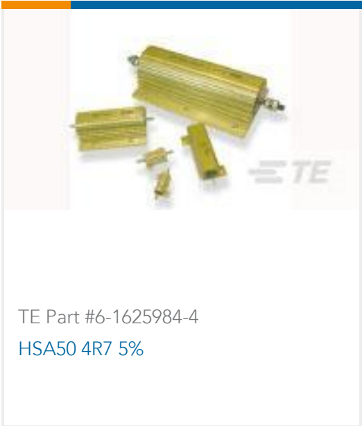
TE Part #6-1625984-4 HSA50 4R7 5%