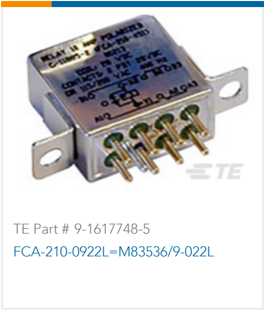
TE Part # 9-1617748-5 FCA-210-0922L=M83536/9-022L