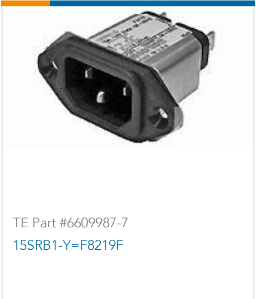
TE Part #6609987-7 15SRB1-Y=F8219F