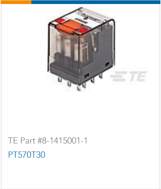
TE Part #8-1415001-1 PT570T30