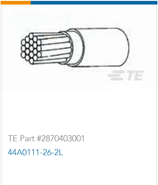
TE Part #2870403001 44A0111-26-2L