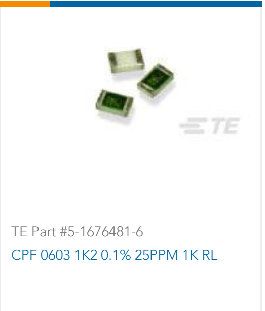
TE Part #5-1676481-6 CPF 0603 1K2 0.1% 25PPM 1K RL