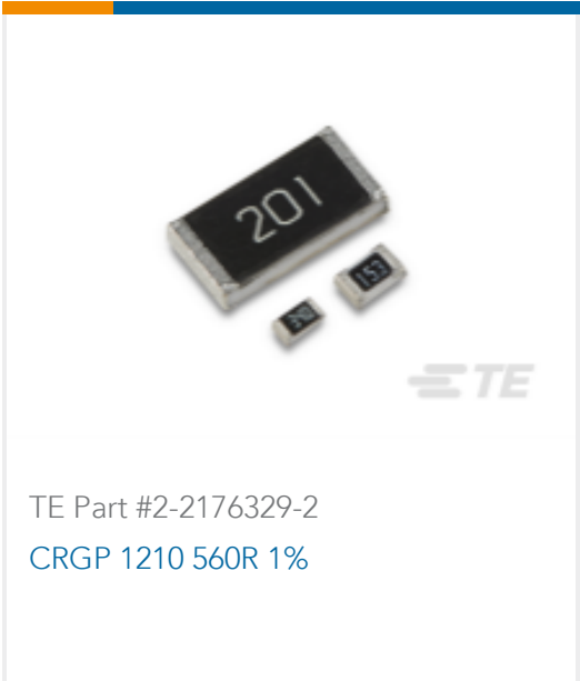
TE Part #2-2176329-2 CRGP 1210 560R 1%