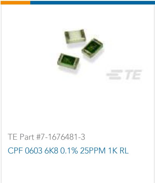
TE Part #7-1676481-3 CPF 0603 6K8 0.1% 25PPM 1K RL