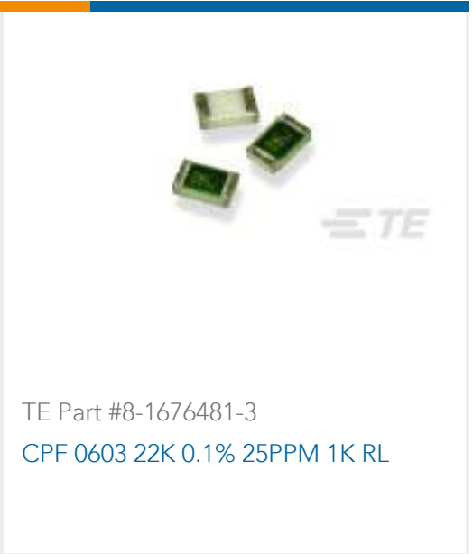
TE Part #8-1676481-3 CPF 0603 22K 0.1% 25PPM 1K RL