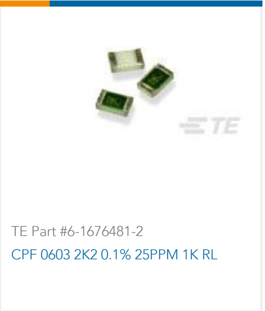
TE Part #6-1676481-2 CPF 0603 2K2 0.1% 25PPM 1K RL