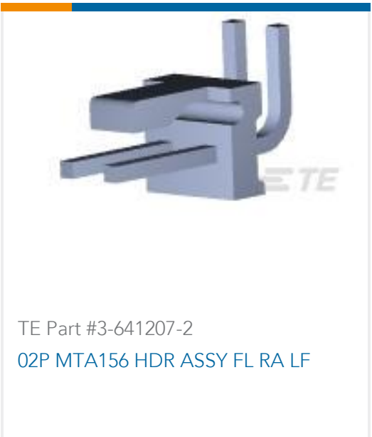
TE Part #3-641207-2 02P MTA156 HDR ASSY FL RA LF