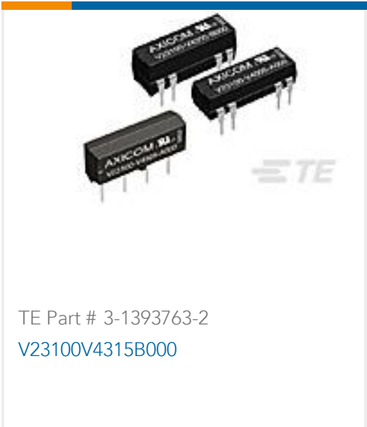
TE Part # 3-1393763-2 V23100V4315B000