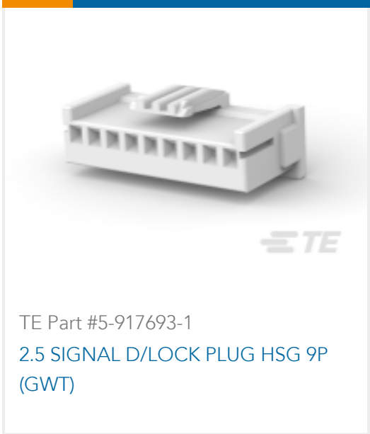
TE Part #5-917693-1 2.5 SIGNAL D/LOCK PLUG HSG 9P (GWT)