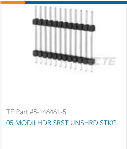
TE Part #5-146461-5 05 MODII HDR SRST UNSHRD STKG