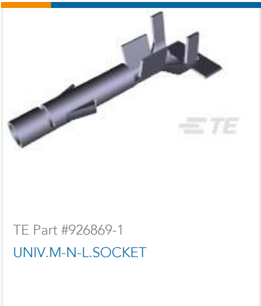
TE Part #926869-1 UNIV.M-N-L.SOCKET