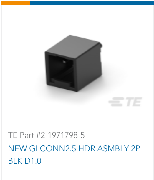
TE Part #2-1971798-5 NEW GI CONN2.5 HDR ASMBLY 2P BLK D1.0