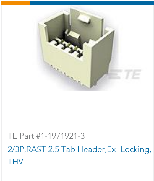
TE Part #1-1971921-3 2/3P,RAST 2.5 Tab Header,Ex- Locking, THV