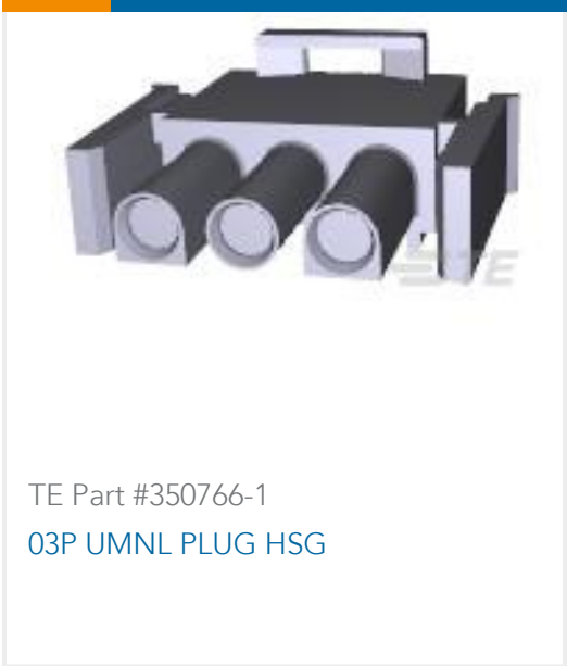
TE Part #350766-1 03P UMNL PLUG HSG