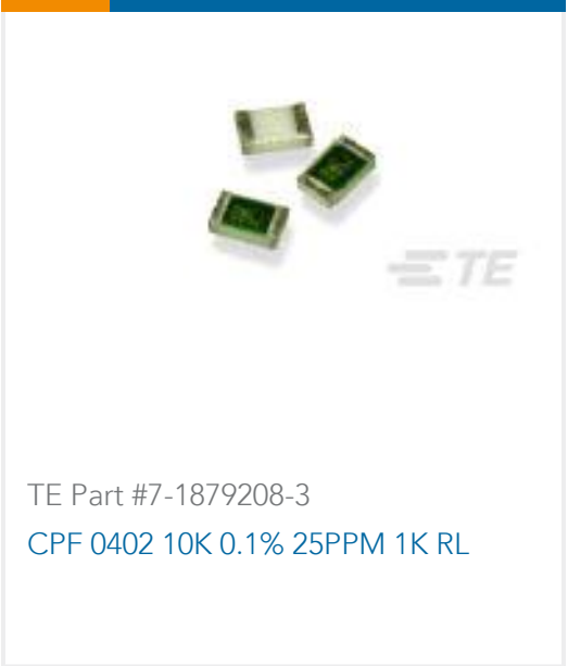
TE Part #7-1879208-3 CPF 0402 10K 0.1% 25PPM 1K RL