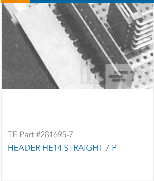
TE Part #281695-7 HEADER HE14 STRAIGHT 7 P