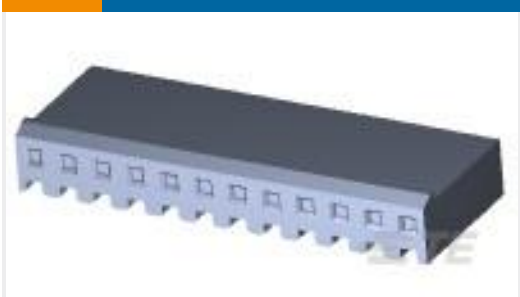
TE Part #1-640250-2 12P SL156 HSG W/LCK RAMP NATL