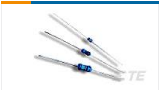
TE Part #1622600-1 LR1L 5% R22