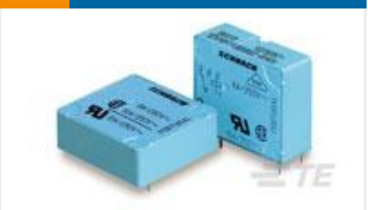
TE Part #6-1393215-9 V23057-B0002-A201