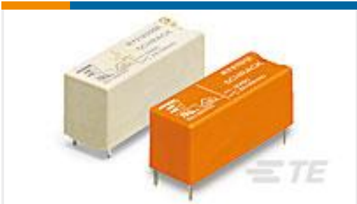
TE Part #4-1393224-2 RY211005