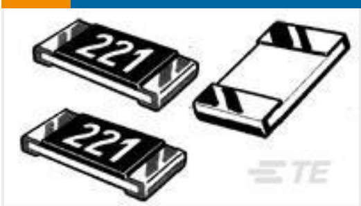
TE Part #2176071-5 3521 200K 1% 2W