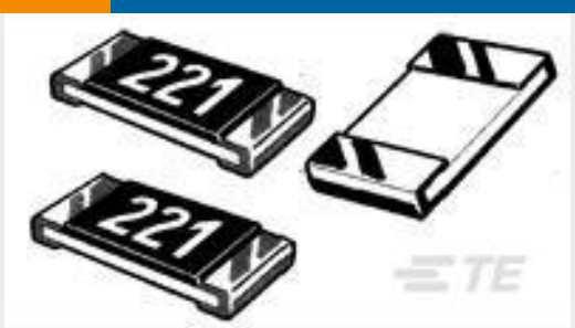
TE Part #3-2176230-0 3522 220R 5% 3W