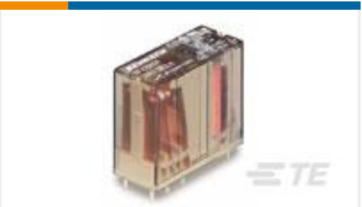
TE Part #6-1393234-7 RP421012