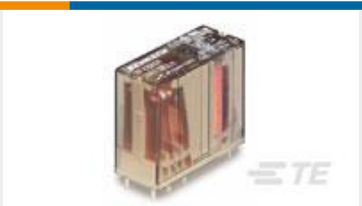
TE Part #6-1393234-8 RP421024