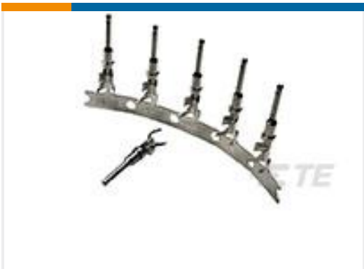
TE Part #1060-14-0122 PIN, SF, SIZE 16, 14-18, NI/SN