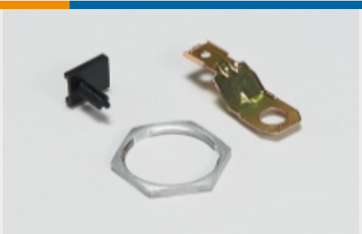
Other Automotive Connector Accessories(7)