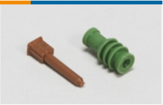
Automotive Seals & Cavity Plugs(3)