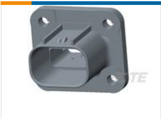
TE Part #2103247-1 SPLIT HEADER ASSY, KEY A, HVA280