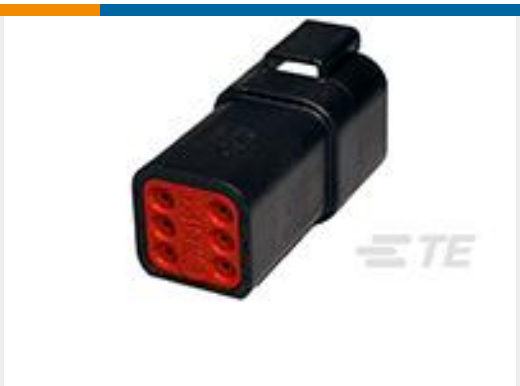
TE Part #DT04-6P-CE02 REC, 6P, BLK, E