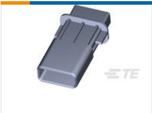
TE Part #2103321-1 3p Inner Hsg, Split Hdr, Key A, HVA280