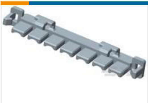
TE Part #1-1969609-2 12P VAL-U-LOK TPA 26-22 AWG