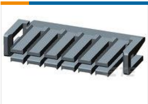
TE Part #2-1969541-8 RETAINER, TPA, DUAL ROW, EP2.5