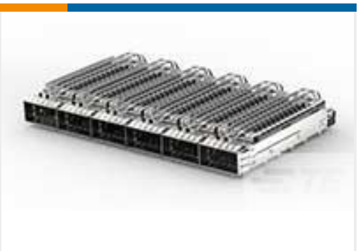
TE Part #2-2170708-1 CAGE ASSY, 1X6, QSFP28, SPRING, HS, LP