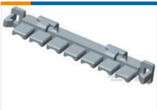
TE Part #1-1969609-1 11P VAL-U-LOK TPA 26-22 AWG