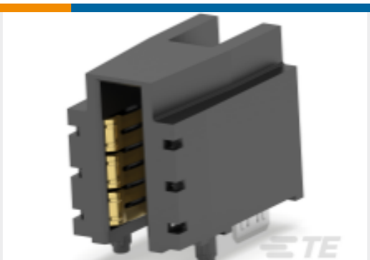
TE Part #2204018-2 CC 150 - CROWN CLIP Dual Power Connector