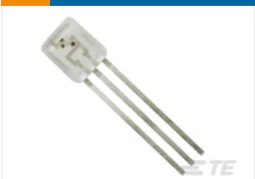
TE Part #11032254-00 EMITTER 660/940NM 1 2