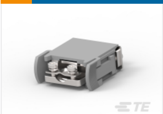
TE Part #T2111092201-007 HMN-009-F