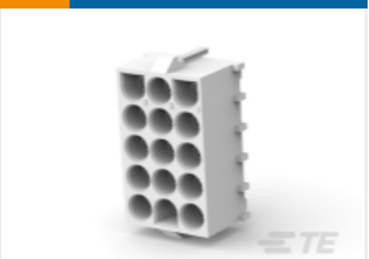
TE Part #2213756-4 3 ROW 15P HIGH TEMP UMNL SKT ASSM