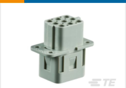
TE Part #T2019092201-000 HQ-008-F