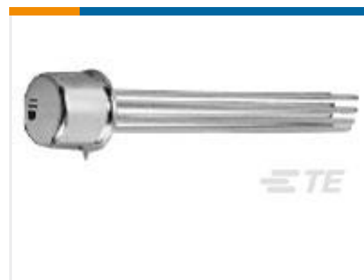
TE Part #4-1617540-9 J1MAC-12XL=M39016/7-028L