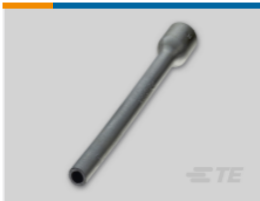
TE Part #558823-000 Low Profile Heat Shrink Boots: Poly Molded, Lipped, Straight