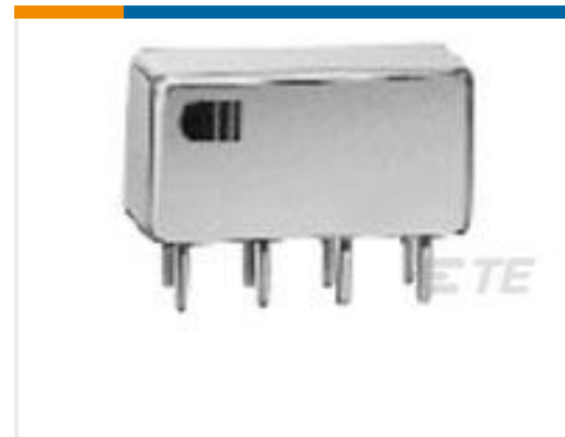
TE Part #1-1617036-2 HFW4A1201K00 = 2100 HFW 4A REL