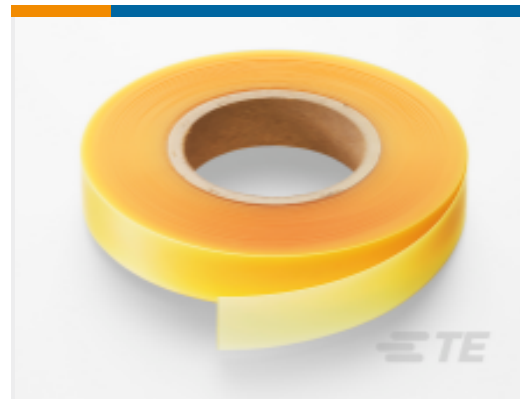
TE Part #890113-000 S1048-TAPE-1X100-FT