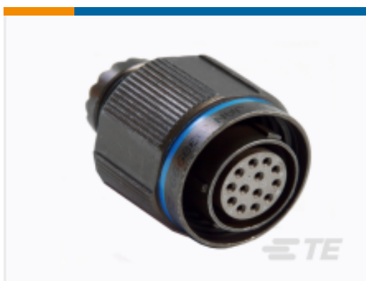
TE Part #YDTS26F09-98SNV001 PLUG ASSY