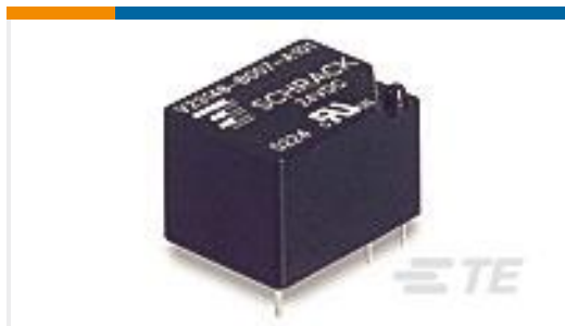
TE Part #2-1393203-4 V23148-A0107-A101