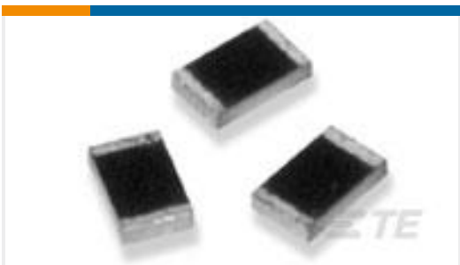
TE Part #6-1879255-1 RP 2B 82R5 0.1% 15PPM CUT LENGTH