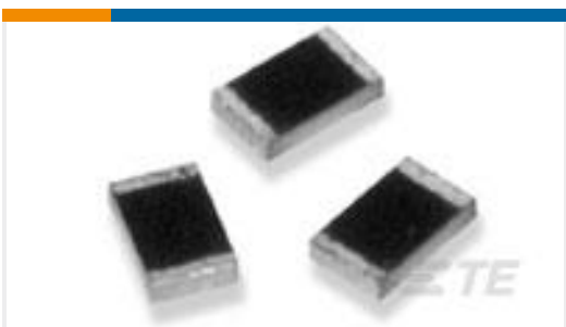
TE Part #1879271-7 RP 2A 113R 0.1% 15PPM CUT LENGTH