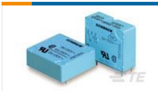
TE Part #6-1393215-6 V23057-B0001-A101