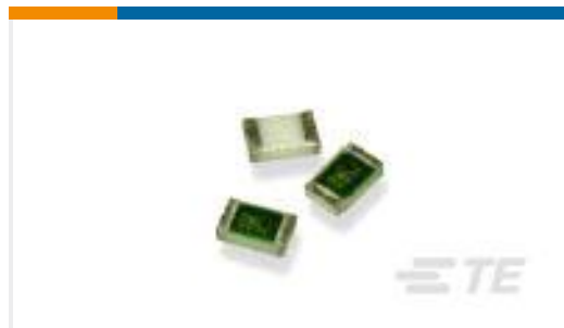
TE Part #2176215-4 CPF A 0402 499R 0.1% 25PPM 1K RL