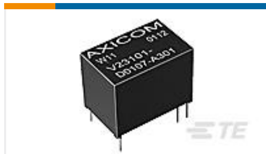
TE Part #1413012-1 V23101D1007B201