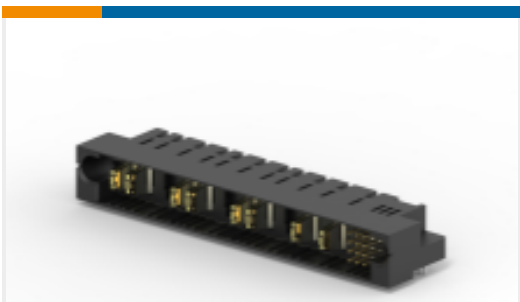
TE Part #1892302-1 MBXL R/A HDR DB 11P+12S