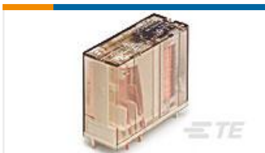
TE Part #6-1415011-1 V23047-A1006-A511