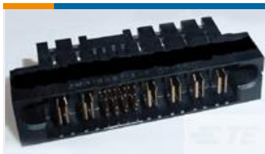
TE Part #1892301-1 MBXL R/A HDR DB 12S+11P