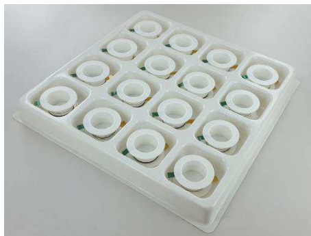
Individual Packaging on Spools