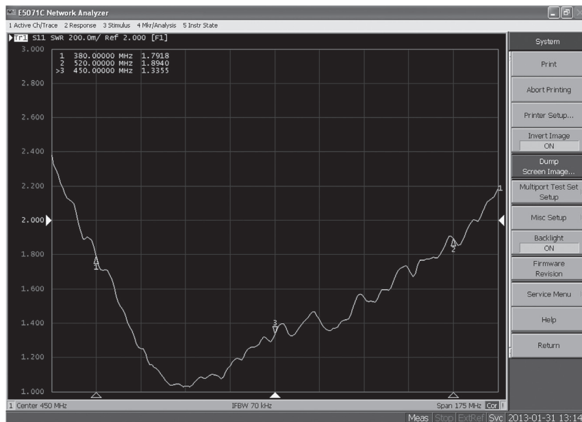
VSWR Plot (Measured on 2' x 2' GP)