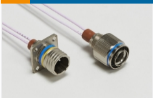
MC801 Fiber Connectors(131)

This information is provided based on reasonable inquiry of our suppliers and represents our current actual knowledge based on the information they provided. This information is subject to change. The part numbers that TE has identified as EU RoHS compliant have a maximum concentration of 0.1% by weight in homogenous materials for lead, hexavalent chromium, mercury, PBB, PBDE, DBP, BBP, DEHP, DIBP, and 0.01% for cadmium, or qualify for an exemption to these limits as defined in the Annexes of Directive 2011/65/EU (RoHS2). Finished electrical and electronic equipment products will be CE marked as required by Directive 2011/65/EU. Components may not be CE marked. Additionally, the part numbers that TE has identified as EU ELV compliant have a maximum concentration of 0.1% by weight in homogenous materials for lead, hexavalent chromium, and mercury, and 0.01% for cadmium, or qualify for an exemption to these limits as defined in the Annexes of Directive 2000/53/EC (ELV). Regarding the REACH Regulation, the information TE provides on SVHC in articles for this part number is based on the latest European Chemicals Agency (ECHA) ‘Guidance on requirements for substances in articles’ posted at this URL: https://echa.europa.eu/guidance-documents/guidance-on-reach