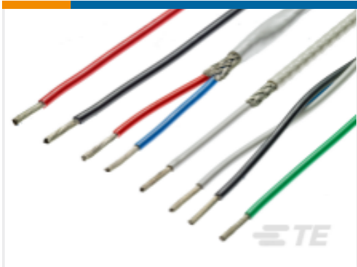
TE Part #472967-000 CTC-0018-22-9/5-9CS2340