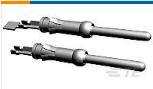
TE Part #1-66099-6 III+ PIN,18-16,TIN,SMPACK