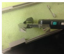
INCORRECT ID TUBING IS STRETCHED

When the tubing is expanded it becomes a lighter color. Black can become grey, red can turn more of a pink color, etc. What this means is that the color as received may not be the final color after it is recovered. This is not a defect, as color is judged on the recovered tubing, not the as received (or fully expanded) tubing. A sample should be cut, fully recovered and allowed to cool to properly evaluate the color.