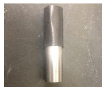
CORRECT ID PLUG GAGE KEEPS TUBING ROUND