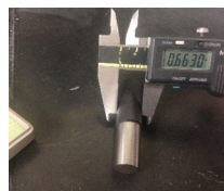
CORRECT OD PLUG GAGE KEEPS TUBING FROM BEING SQUEEZED