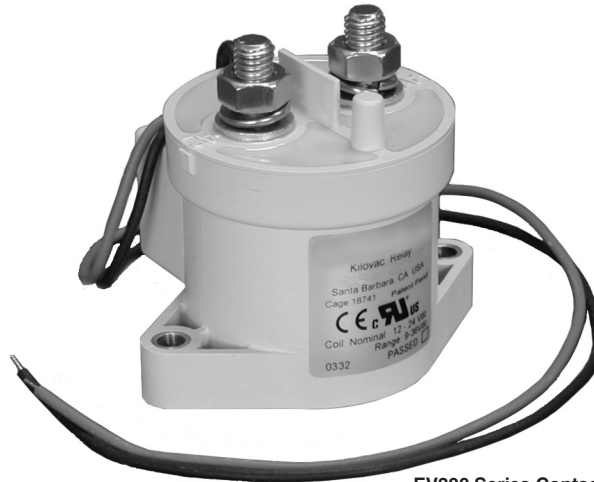
EV200 Series Contactor (CZONKA Relay, Type)