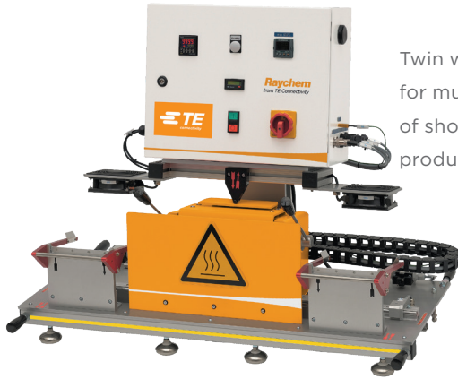
Twin workstation heater for multiple installation of short length tubing products