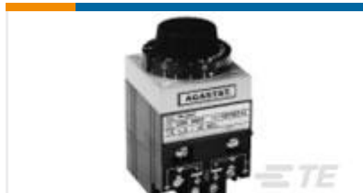
TE Part #5-1423159-6 7012SKX=RLY,STD,ON,2P, 250VDC,