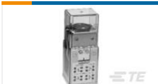
TE Part #1-1423155-4 GPF=RELAY, 250VDC