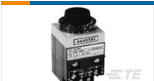
TE Part #3-1423162-9 7022BFX=RLY,STD,OFF,2P, 240VAC