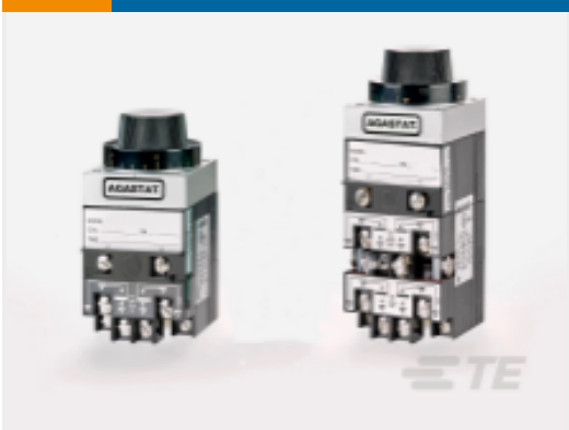
TE Part # 1-1423162-8 7022AK=RLY,STD,OFF,2P, 120VAC,1