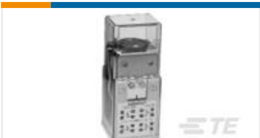
TE Part #1423155-3 GPC=RELAY,48VDC