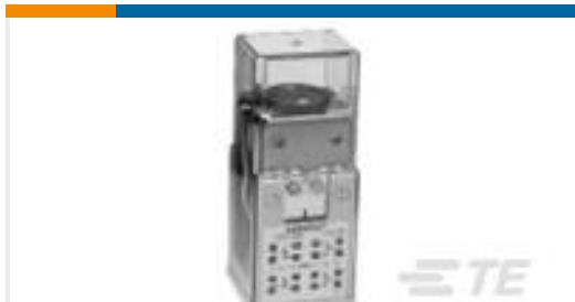
TE Part #1-1423155-5 GPFN=RLY,GEN,PURP, 250VDC