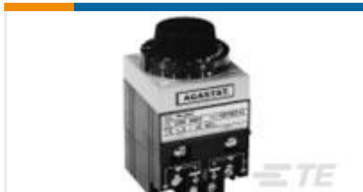
TE Part #3-1423157-5 7012BJX=RLY,STD,ON,2P, 240VAC,