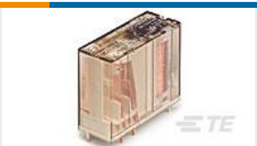
TE Part #1-1415012-1 V23047-A1110-A501