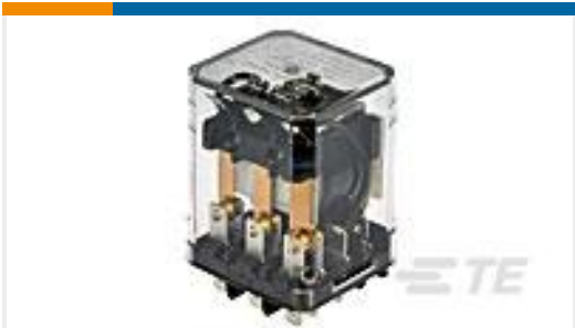
TE Part #2-1393118-6 KUP-14D35-110=KU