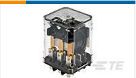
TE Part #3-1393118-1 KUP-14D45-110=KU