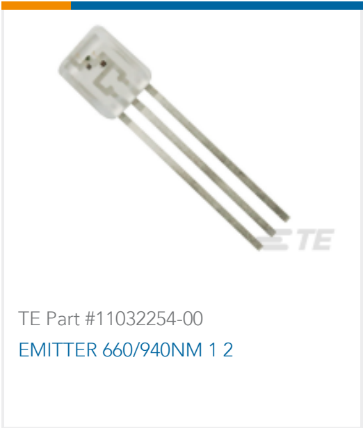
TE Part #11032254-00 EMITTER 660/940NM 1 2