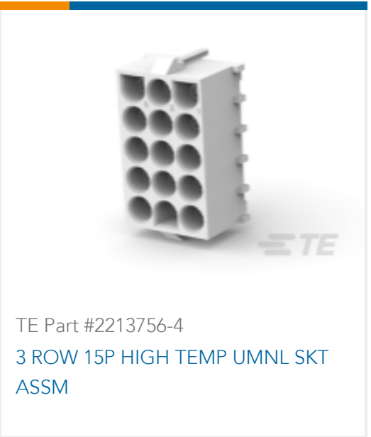
TE Part #2213756-4 3 ROW 15P HIGH TEMP UMNL SKT ASSM