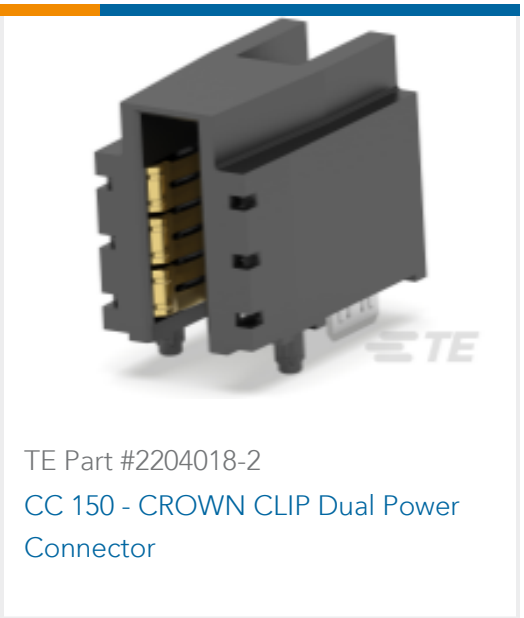
TE Part #2204018-2 CC 150 - CROWN CLIP Dual Power Connector