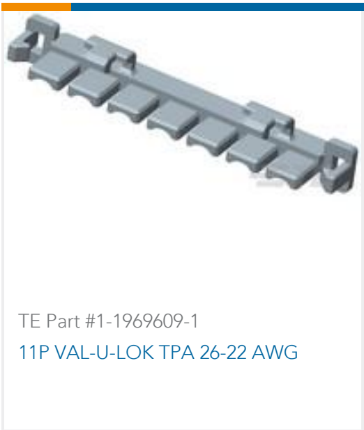
TE Part #1-1969609-1 11P VAL-U-LOK TPA 26-22 AWG