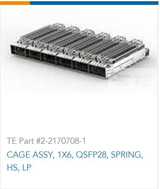
TE Part #2-2170708-1 CAGE ASSY, 1X6, QSFP28, SPRING, HS, LP