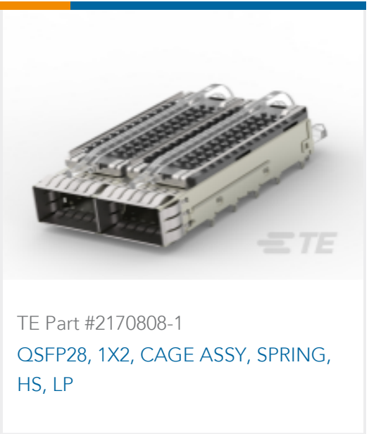
TE Part #2170808-1 QSFP28, 1X2, CAGE ASSY, SPRING, HS, LP