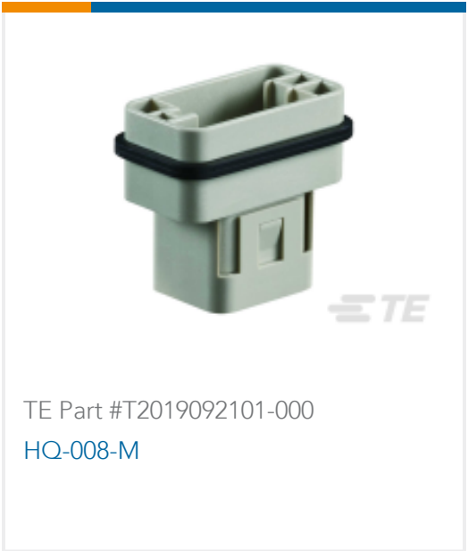
TE Part #T2019092101-000 HQ-008-M