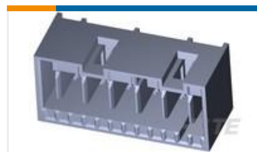
TE Part #1971846-6 6P, RAST 5 Tab Header, THV