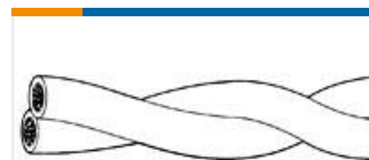
TE Part #080171-000 55PC0221-20-6/9