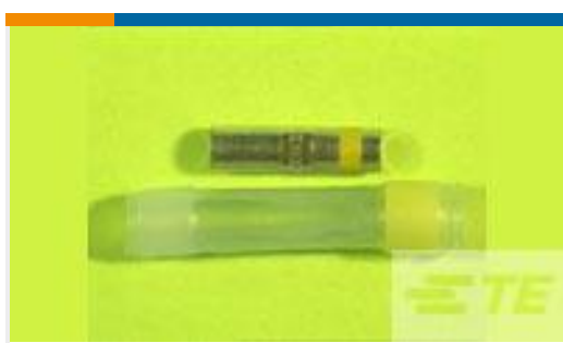
TE Part # 650075-000 D-436-37