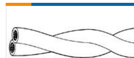
TE Part #661503-000 55PC0221-22-6/9