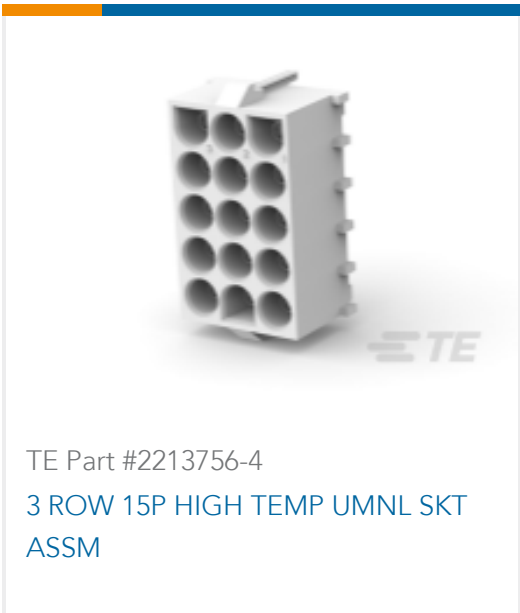
TE Part #2213756-4 3 ROW 15P HIGH TEMP UMNL SKT ASSM