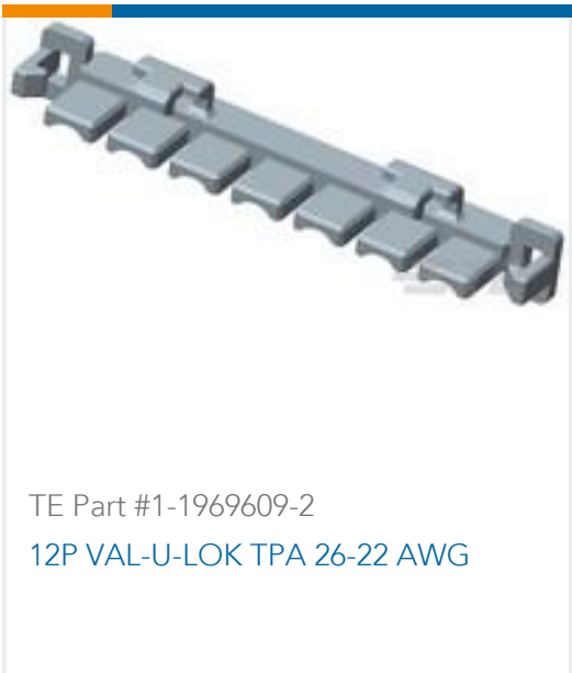
TE Part #1-1969609-2 12P VAL-U-LOK TPA 26-22 AWG