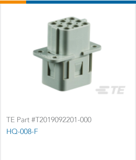
TE Part #T2019092201-000 HQ-008-F