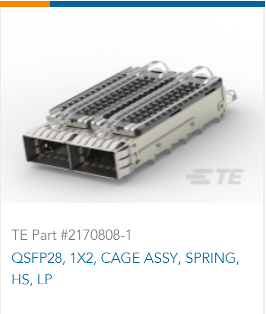
TE Part #2170808-1 QSFP28, 1X2, CAGE ASSY, SPRING, HS, LP