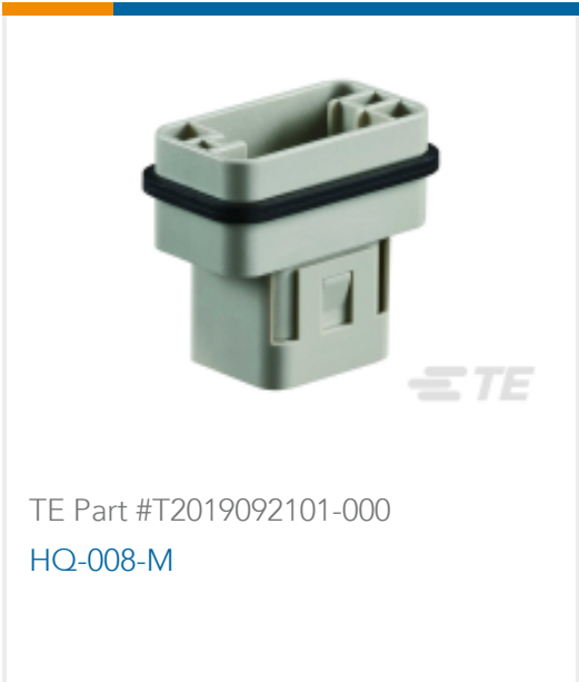
TE Part #T2019092101-000 HQ-008-M