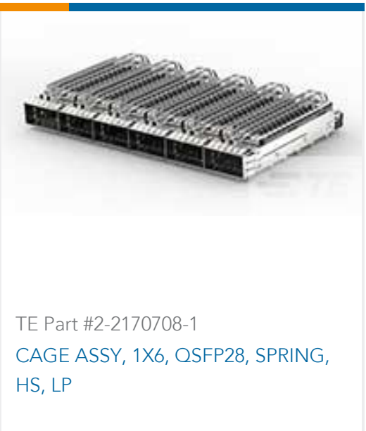
TE Part #2-2170708-1 CAGE ASSY, 1X6, QSFP28, SPRING, HS, LP