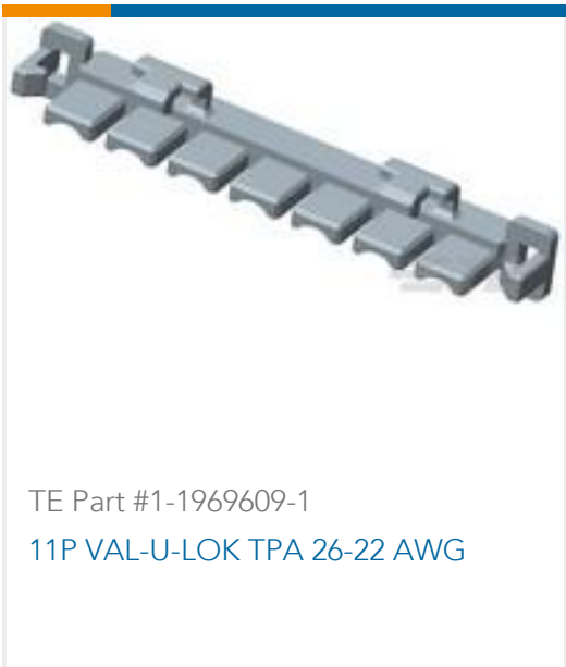
TE Part #1-1969609-1 11P VAL-U-LOK TPA 26-22 AWG