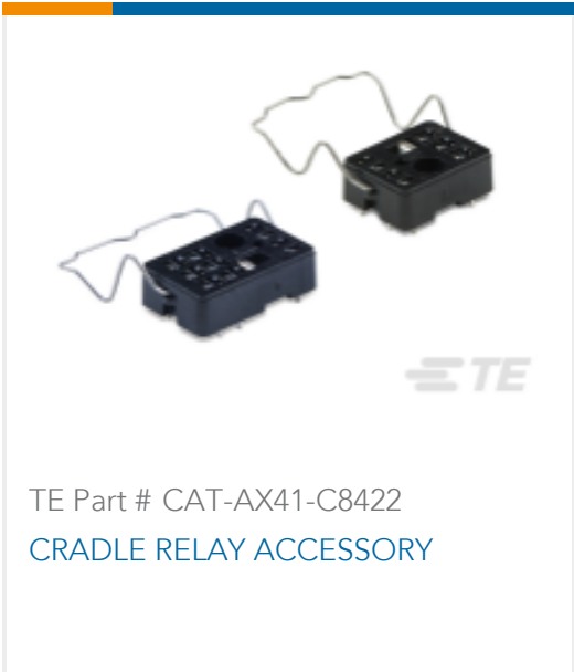
TE Part # CAT-AX41-C8422 CRADLE RELAY ACCESSORY