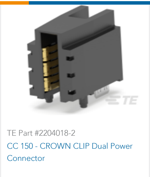
TE Part #2204018-2 CC 150 - CROWN CLIP Dual Power Connector