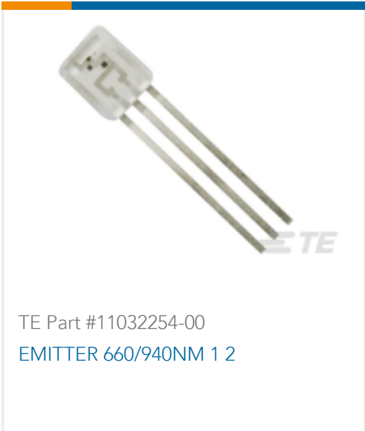
TE Part #11032254-00 EMITTER 660/940NM 1 2