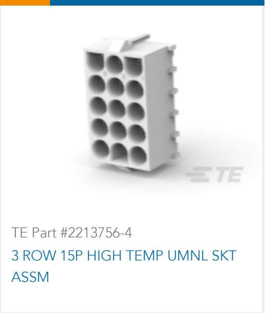
TE Part #2213756-4 3 ROW 15P HIGH TEMP UMNL SKT ASSM