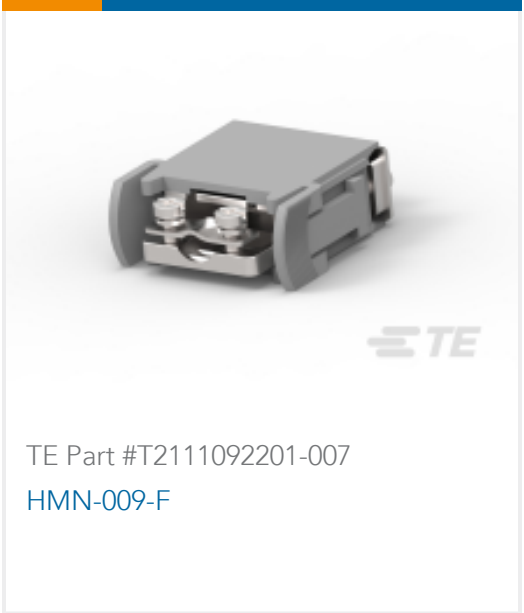
TE Part #T2111092201-007 HMN-009-F