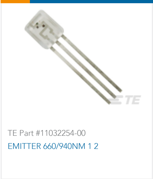
TE Part #11032254-00 EMITTER 660/940NM 1 2