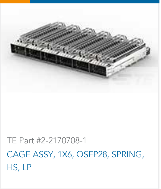
TE Part #2-2170708-1 CAGE ASSY, 1X6, QSFP28, SPRING, HS, LP