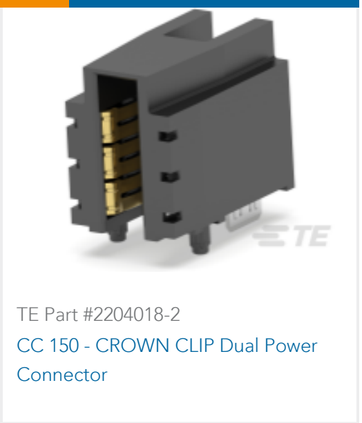
TE Part #2204018-2 CC 150 - CROWN CLIP Dual Power Connector