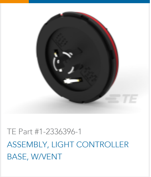
TE Part #1-2336396-1 ASSEMBLY, LIGHT CONTROLLER BASE, W/VENT