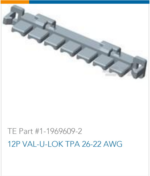
TE Part #1-1969609-2 12P VAL-U-LOK TPA 26-22 AWG