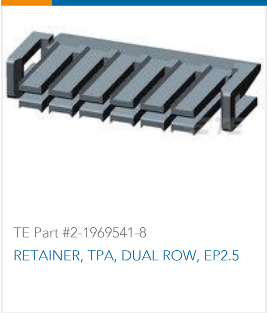
TE Part #2-1969541-8 RETAINER, TPA, DUAL ROW, EP2.5