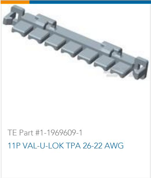
TE Part #1-1969609-1 11P VAL-U-LOK TPA 26-22 AWG