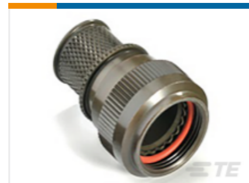
TE Part #BTH1-15-08-1-ZN BTH1-15-08-1-ZN