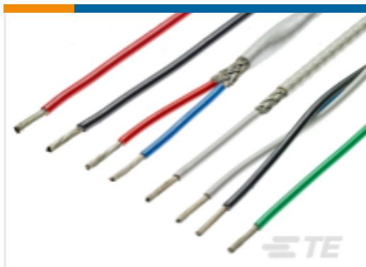
TE Part #109761-000 44A0141-20-9/90/92/96