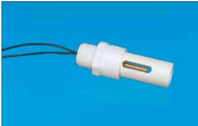
Standard Outdoor Air Temperature Sensor

Standard temp accuracy is \pm 0.2^{\circ}\text{C} from 0^{\circ}\text{C} to 70^{\circ}\text{C} Resistance versus temperature information for material curve Z can be found on page 59.