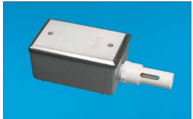
Outdoor Air Sensor with Weatherproof Box