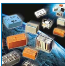
Schrack PCB Relays