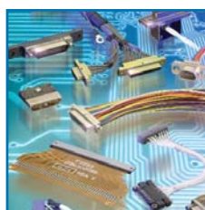
Microdot Connectors and Cables