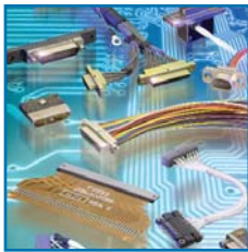
Microdot Connectors and Cables