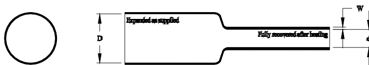
Table 1: Dimensions