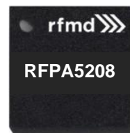
Package: Laminate, 10-pin, 4mm x 4mm x 1.05mm max

The RFPA5208 is a three-stage power amplifier (PA) designed for WiFi 802.11b/g/n/ac systems. The integrated input and output 50Ω match and integrated regulator minimizes layout area in the customer's application, reduces the bill of materials and manufacturability cost. Performance is focused on a balance of efficiency and linear power that increases the range of connection. The RFPA5208 integrates the Power Amplifier (PA), regulator and a power detector coupler for improved accuracy. The device is provided in a 4mm x 4mm x 1.05mm, 10-pin laminate package.