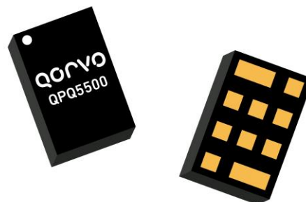
10 Pad 1.1 x 1.7 mm Laminate Package