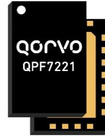
22 Pad 3 x 4.5 x 1 mm Laminate Package