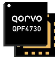
16 Pad 3 x 3 mm Laminate Package