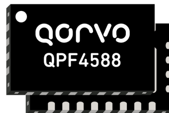
24 Pin 5x3 mm QFN Package