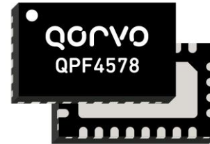
24 Pin 5x3 mm QFN Package

The QPF4578 integrates a 5 GHz power amplifier (PA), single pole two throw switch (SP2T) and bypassable low noise amplifier (LNA) into a single device