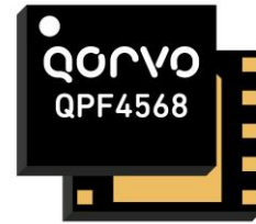
10 Pad 2.0x1.7 mm Laminate Package

The QPF4568 integrates a 5 GHz power amplifier (PA), single pole two throw switch (SP2T) and bypassable low noise amplifier (LNA) into a single device.