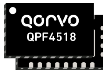
24 Pin 5x3 mm QFN Package

The QPF4518 integrates a 5 GHz power amplifier (PA), single pole two throw switch (SP2T) and bypassable low noise amplifier (LNA) into a single device.