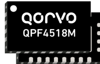
24 Pin 5x3 mm QFN Package