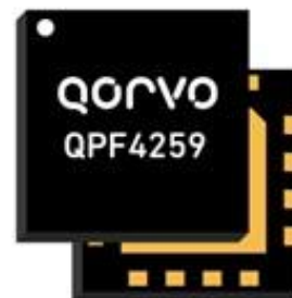
16 Pad 3 x 3 mm Laminate Package